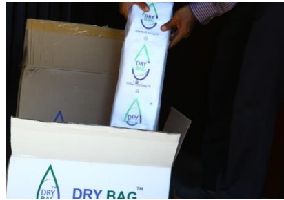
II. Take out the Dry Bag