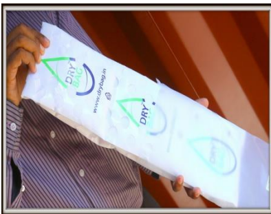
IV. Take out the DryBag