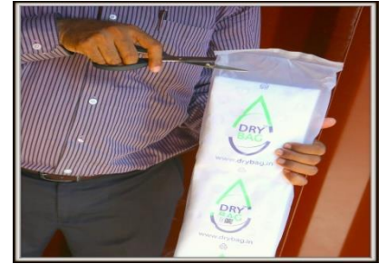
III. Cut open the outer plastic cover