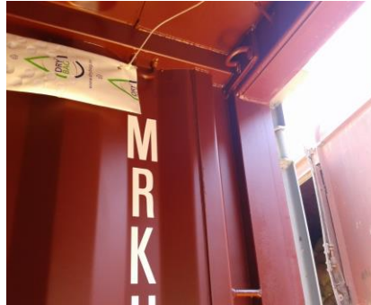
II. Put cable tie through hole Backside