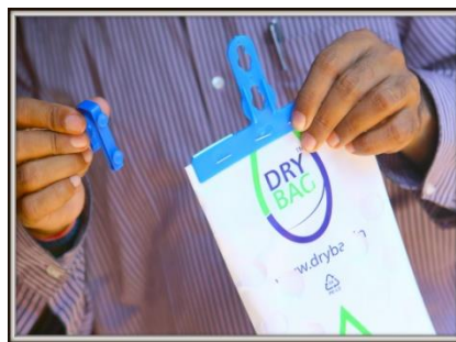
V. Detach the hook from the top