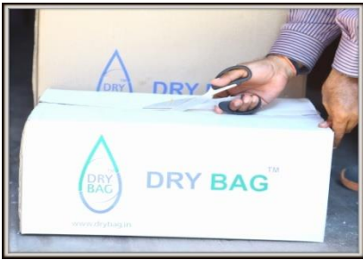
I. Cut Open the Dry bag box