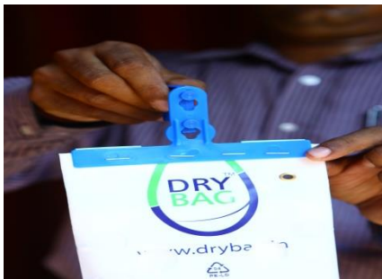
VII. Push the hook on the 2 loops pressing through until it clicks