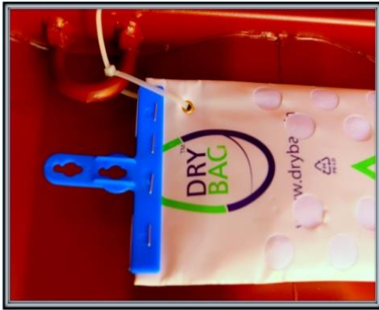
I. Put cable tie through hole Front side