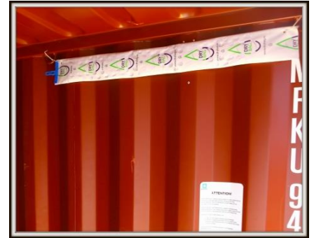
III. Tighten the ties to make DryBag straight & stiff