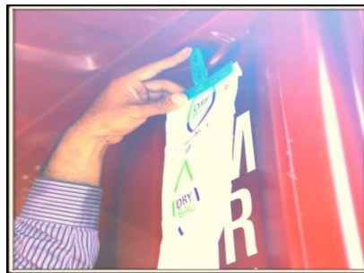
VIII. Press hook securely on to hanger loop